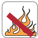
Flame Retardant NF C32-070-2.1(C2) IEC 60332-1/EN 50265-2-1