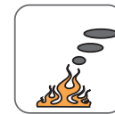
Low Corrosivity EN 50267-2-2/NF C32-074 IEC 60754-2/NF C20-453