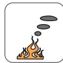
Low Smoke Emission IEC 61034/NFC20-902 EN 50268/NF C32-073