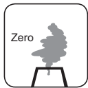
Zero Halogen IEC 60754-1/NF C20-454 EN 50267-2-1